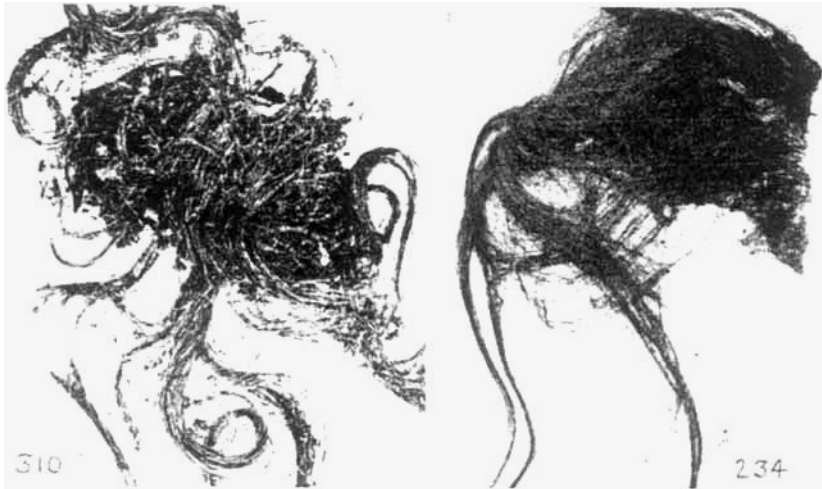
Fig. 1 Photographs of hair samples from Paracas mummies, number 234 and number 310, showing on the one hand hair which is relatively straight and, on the other, hair which is definitely wavy. Magnification approximately \times 4 .